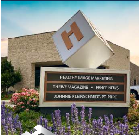
image matters. Make yours a Healthy one.